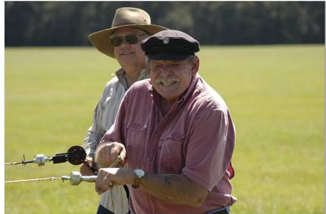
Smile for the Camera