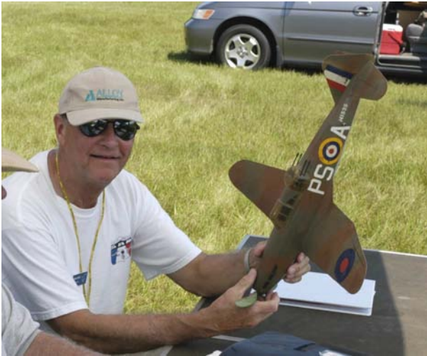
Judging FAC Scale