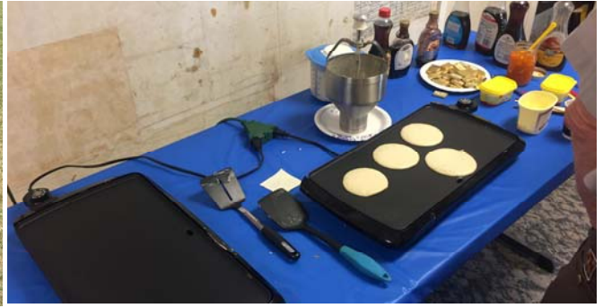
Morning ritual! More important than flying!