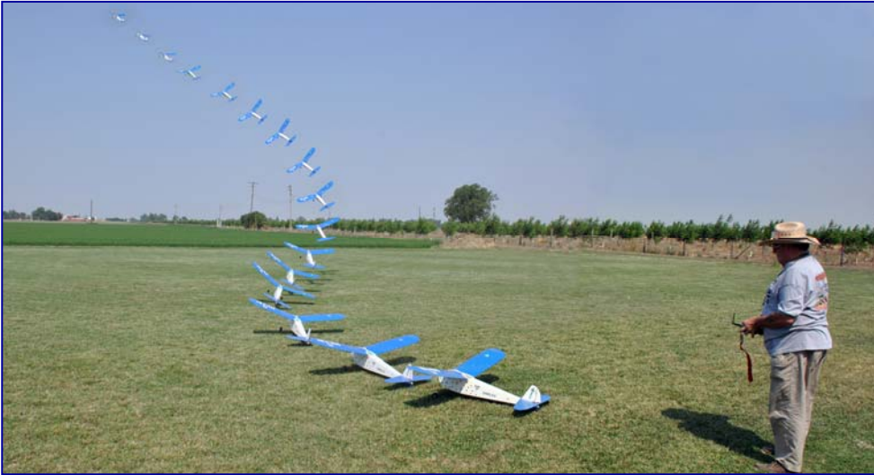
Warren Pickering's special climb out.