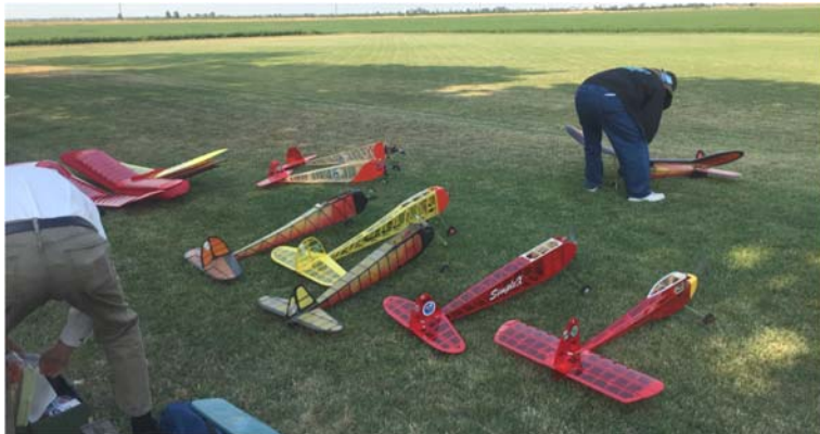
Errrr.... the winning team.