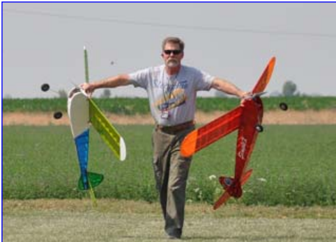
Now this is a good C.D.!