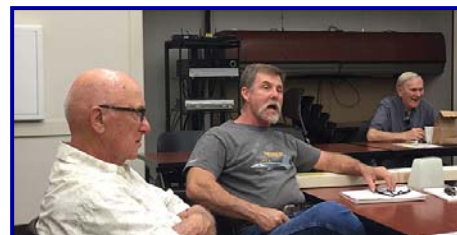
And the discussion gets pretty animated sometimes!

Next meeting: August 23rd, 2018 at: 7:00 p.m.