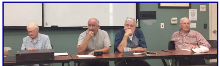
View from the other side of the meeting room!