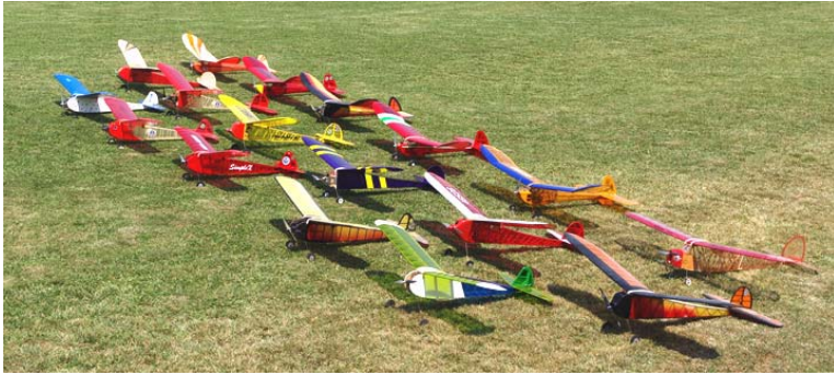
The obligatory before shot, but no plane was hurt during the contest!