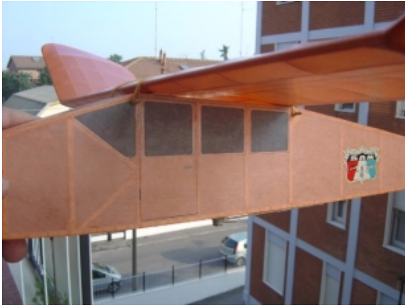
Daniele Viscovi's "six seater" !