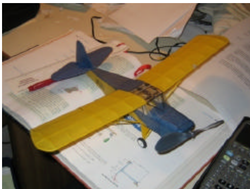
Joshua Finn: Fleet Canuck