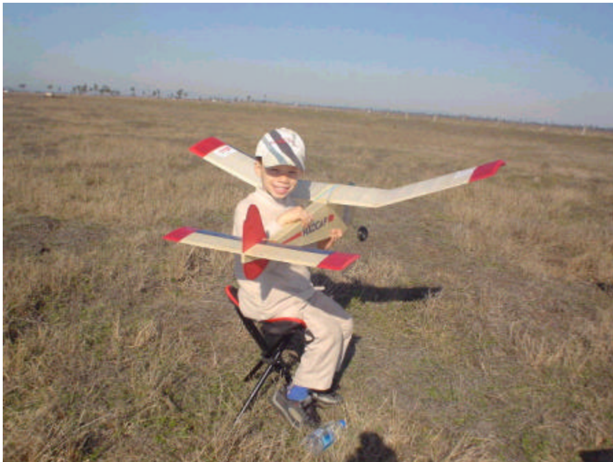
Jack Stover – Australia – with ‘MadCap’