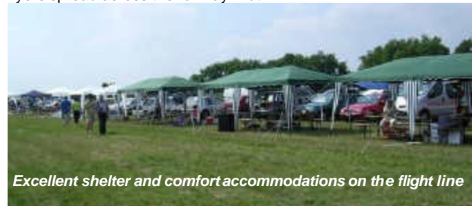
Excellent shelter and comfort accommodations on the flight line

The flying field looked to be superb with the vast mowed runway area and wide free approaches beyond. The airfield included a hanger and office/control tower building, the latter incorporating the organizers processing space and room to host the daily cooked lunch. As with our Czech experience on just such an airfield, we regularly encountered "shared use" of the runway as one or other of the club full-sized planes took off or landed. One such takeoff in a Cessna took the path between two groups of flyers spread across the runway width!