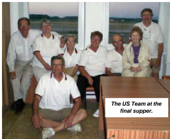
The US Team at the final supper.

At the end of the closing ceremony the president of SAM Hungary invited us to the 6 th European SAM RC Champs that they will host in 2008.