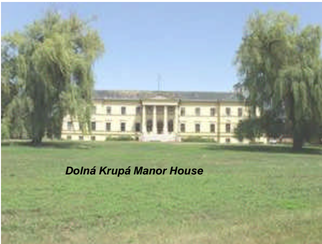
Dolná Krupá Manor House

The classical manor house was built over the years 1793-1795. It is surrounded by an extensive English park in which there is also found a Garden Pavilion, commonly named Beethoven's lodge. L. van Beethoven visited the manor house several times, attracted by the sincere friendship of several members of the Brunswick family (inside story; he had the hots for a woman!). He dedicating several of his compositions to them. During its life the Manor house was one of the most attractive noble residences in Slovakia.